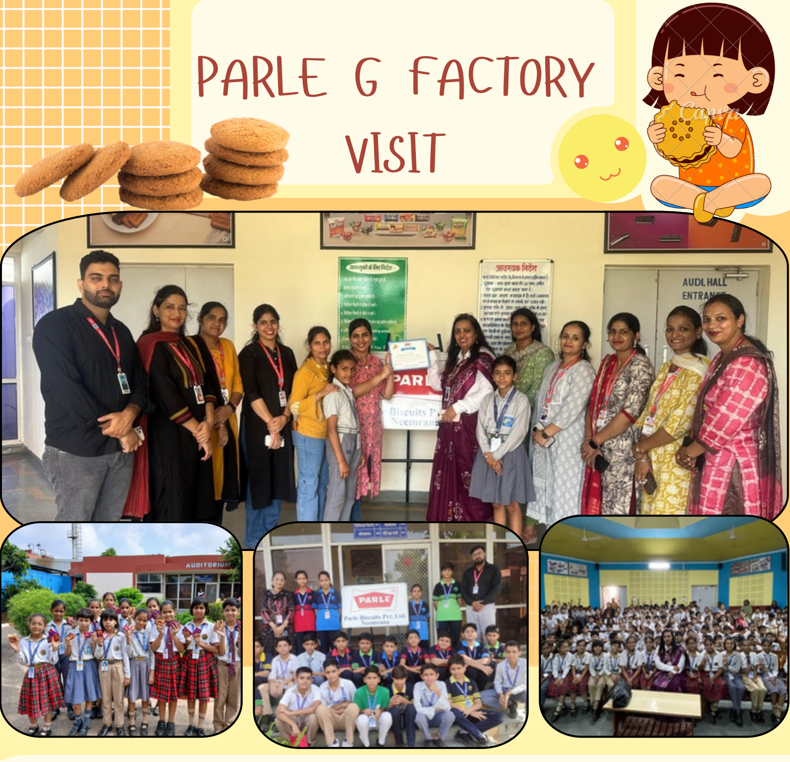
"🚉 🦮 Educational Adventure at Parle Biscuits, Neemrana Plant! 🚱 🏭

Our young learners from Montessori to Grade - VII recently embarked on an exciting industrial visit to the Parle Biscuits Plant in Neemrana.