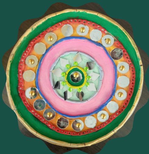
PAHAL (GRADE V)