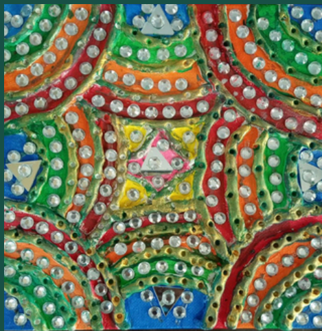
DRISHTI (GRADE V)